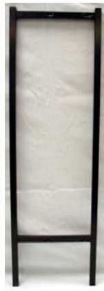
(2) Side Support