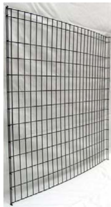
(1) Rear Panel