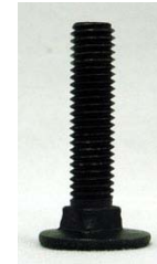
(8) Elevator Bolt