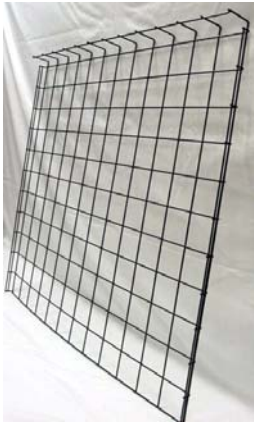
(1) Front Panel