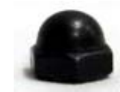
(8) Dome Nut